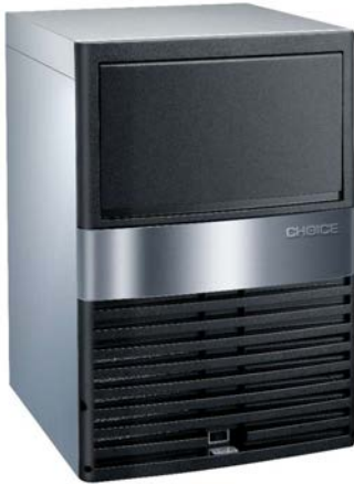
H120A Ice Machine