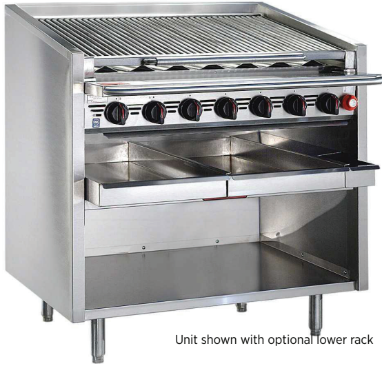
Unit shown with optional lower rack