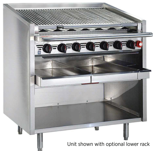
Unit shown with optional lower rack