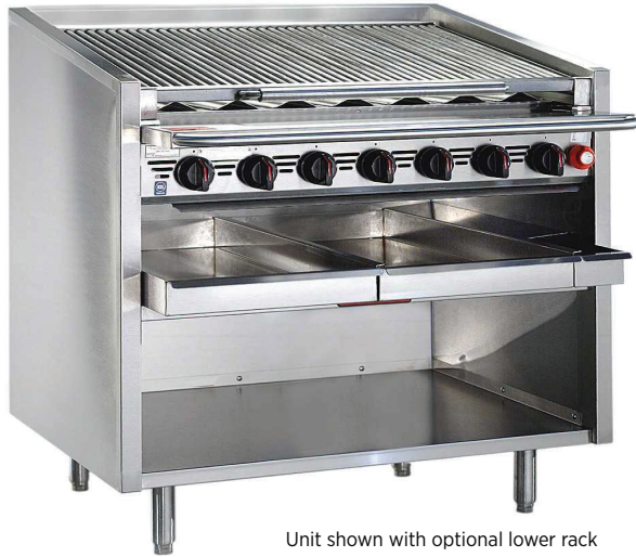
Unit shown with optional lower rack