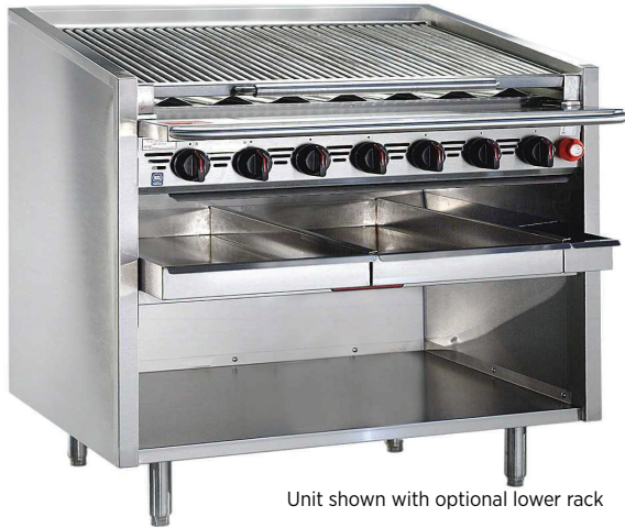
Unit shown with optional lower rack