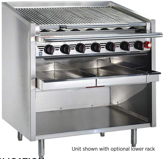
Unit shown with optional lower rack