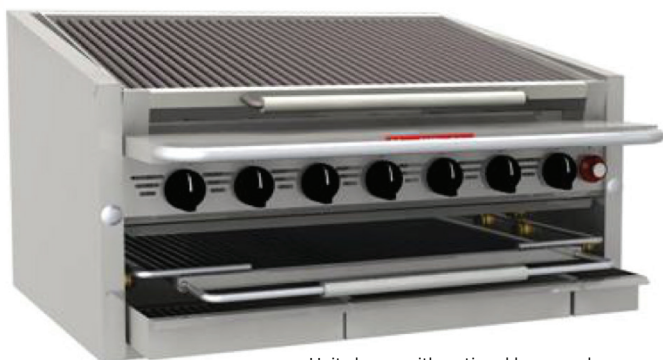
Unit shown with optional lower rack