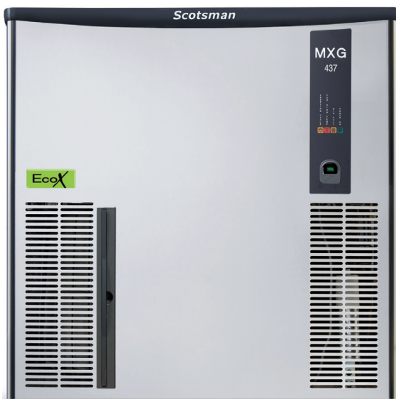
Large gourmet cube 39g, 38mm dia x H 41mm