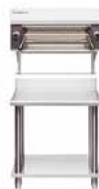
CS9 / C900-S