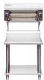
CS9 / C900-S