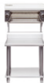
CS9 / C900-S