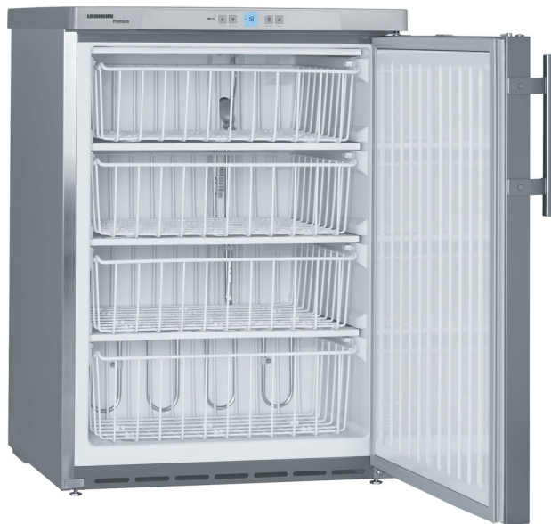
Table-height freezer with static cooling Premium