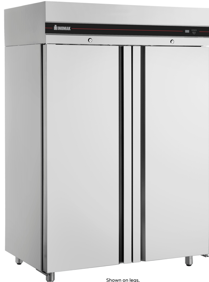
Shown on legs, supplied on castors