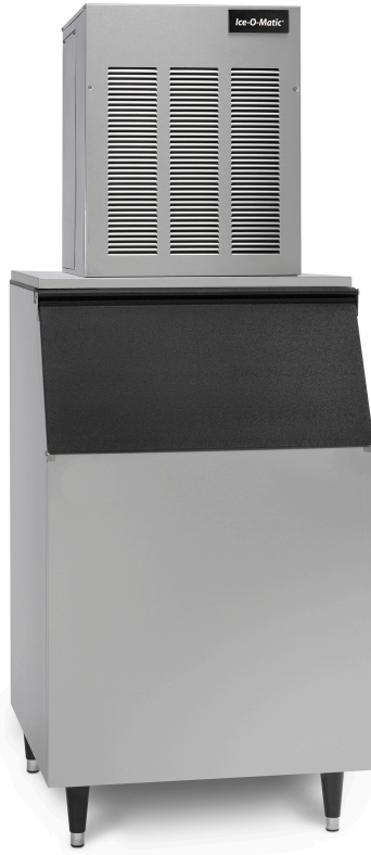
MFIO805 ON CIB230