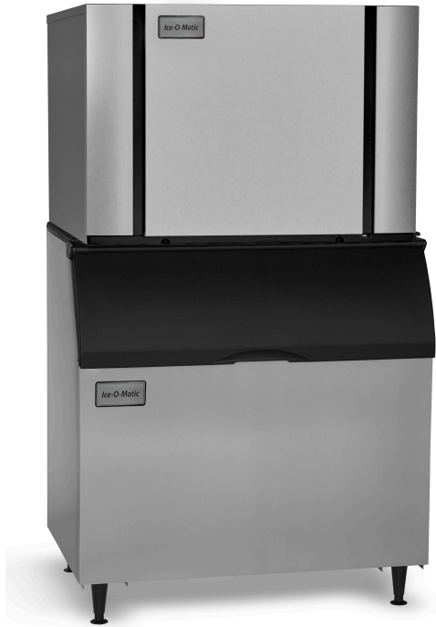
CIM1545 ON B110