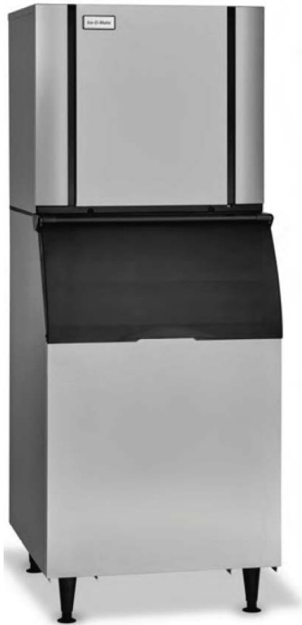
CIM1135 ON CIB230