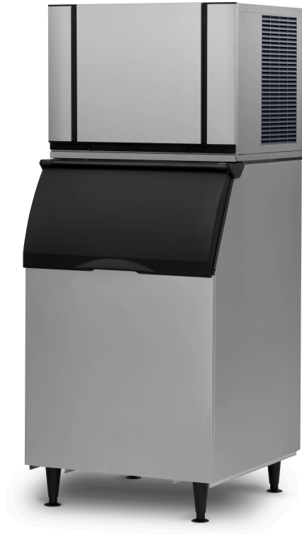
CIMO635 ON CIB230