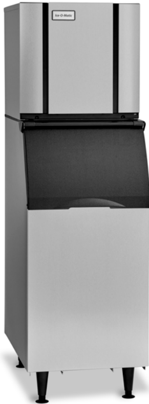
CIMO525 ON B42