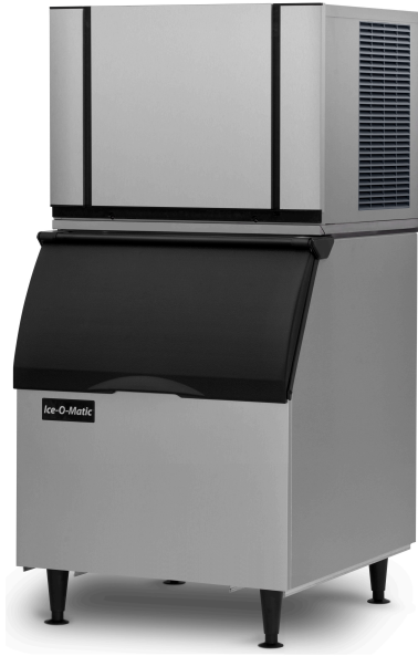
CIMO435 ON B40