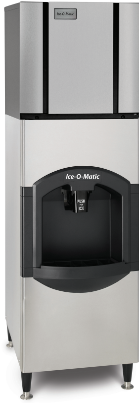
CD40522 WITH CIM0325