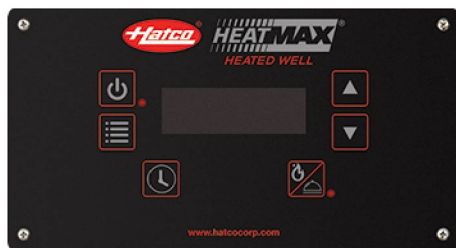
3kw models control