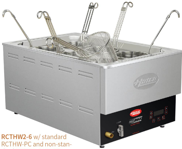
RCTHW2-6 w/ standard RCTHW-PC and non-standard RCTHW-BASKET accessories

www.industrykitchens.com.au 1800 611 058