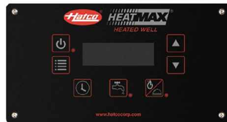
6kw models w/ auto-fill control