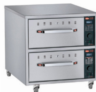
HDW-1N, -2N and -3N Narrow Models Shown With Optional Castors