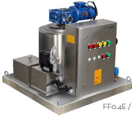
FFo.4E / FFe.6E