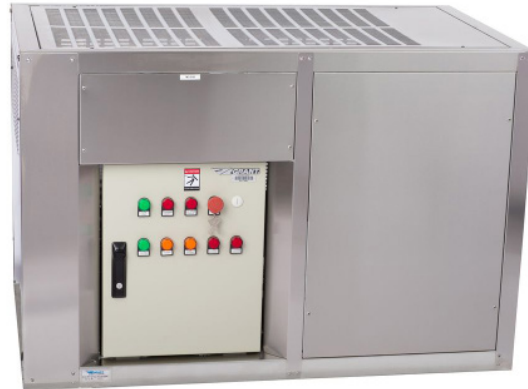
FFo.4AR / FFo.6AR Includes stainless steel covers

The FFAR Series Subzero Flake Ice Machines are designed using advanced technology, with highly economical energy consumption, excellent performance and ease of operation.