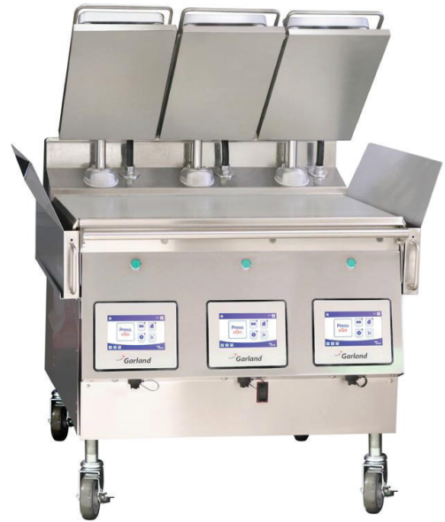
Shown with flared grease cans

SPECIFICATIONS ARE SUBJECT TO CHANGE WITHOUT NOTICE.