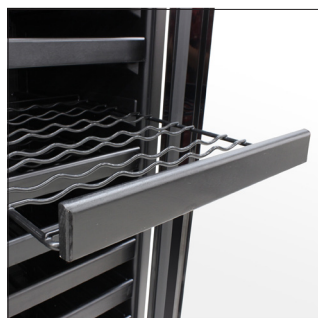
Empty Wine Shelves