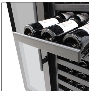
Bottles on Wine Shelves