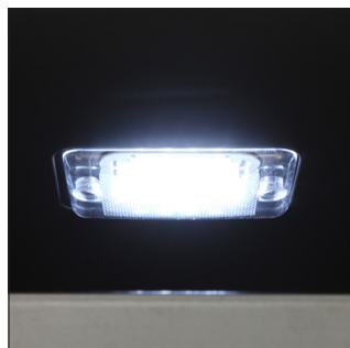
Top Interior Light