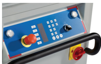
DR-ROBOT2-4/30A Control Panel Electronic with digital readout