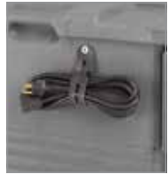
Removable cord stows securely for transport.

Tough, polyethylene exterior stays cool to the touch.