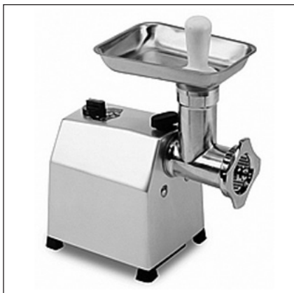
The compact TS8, is ideal for small butcher shops and delicatessens.