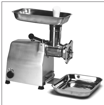
The volume seller of the family, the TS12, is ideal for butcher shops and smaller restaurants