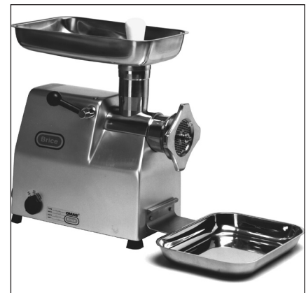
The TS22 works hard in larger butcher shops and restaurants.