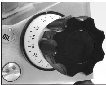
Precision adjustment of slice thickness.