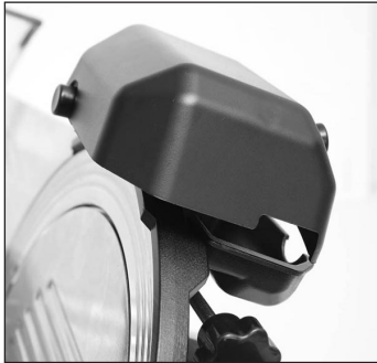
The built-in sharpener is simple and safe to operate.