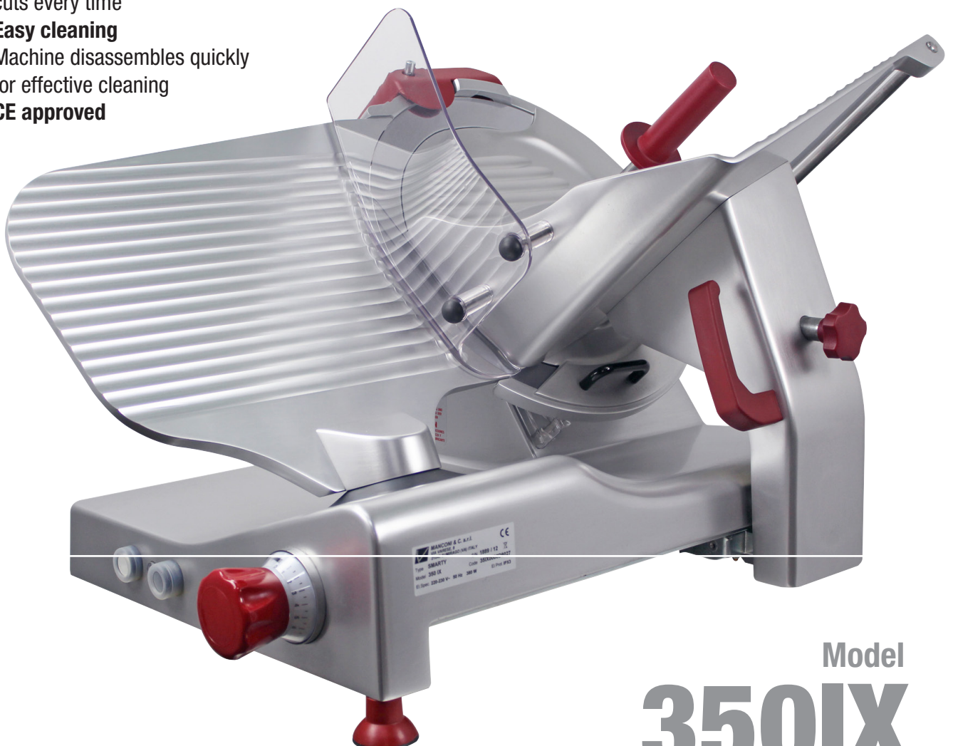
Model 350IX Gravity-feed Slicer