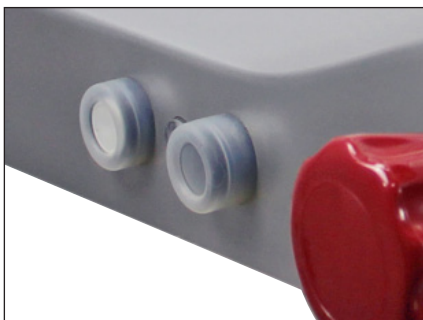
Simple, low-voltage switches turn the 350IX on and off.

The heavy duty Model 350IX Gravity-feed slicer has been designed to handle meats of all kinds.