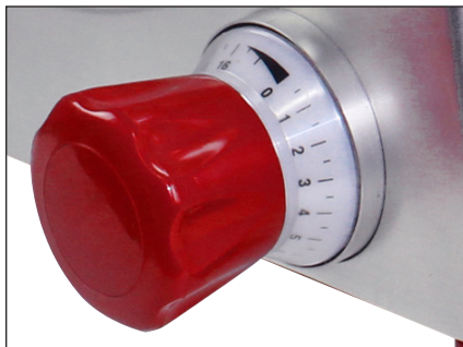
Precision slicing with the micrometric slice thickness knob.