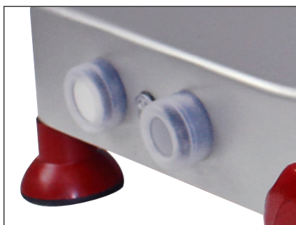
Simple, low-voltage switches turn the 300IX on and off.