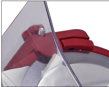
The built-in sharpener is simple and safe to operate.