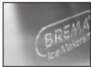
AISI 304 SS Scotch Brite finish