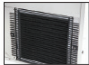
Removable and cleanable air filter