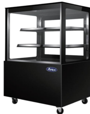
Square Cake Showcase