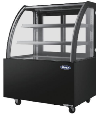
Round Cake Showcase