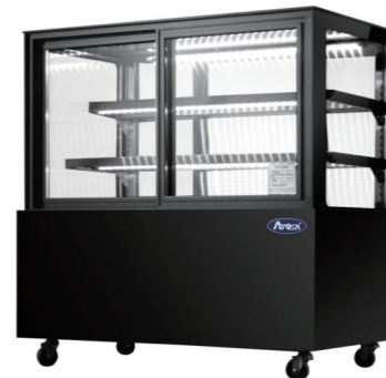
Front Opening Square Cake Showcase