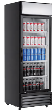
Single Door (Fan Cooling)