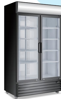
Double Door Cooler (Fan Cooling)