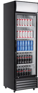
Single Door (Fan Cooling)