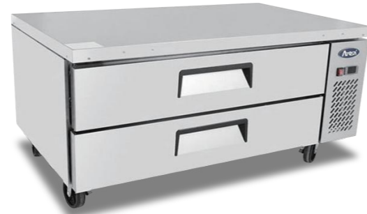
Chef Base - 2 Drawers