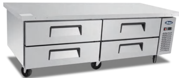
Chef Base - 4 Drawers