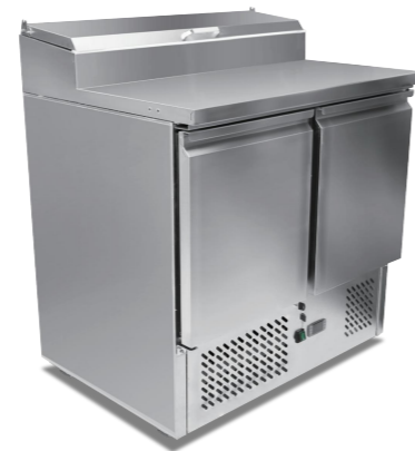
Two Doors Open Top Saladette