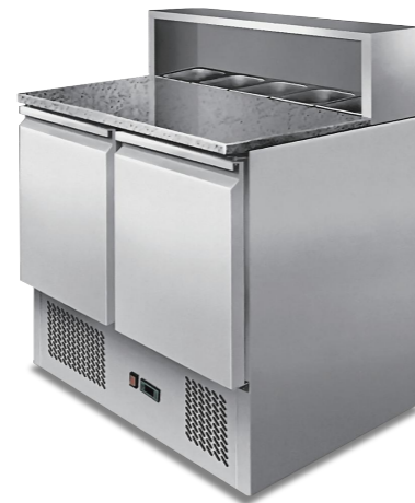
Two Doors Pizzatable Marble Top Saladette