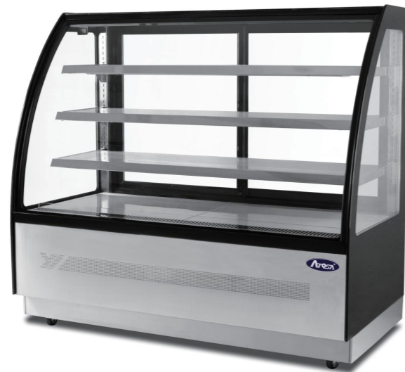
Upright Round Cake Showcase