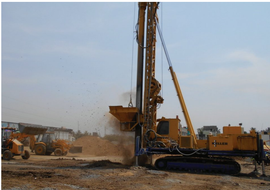
Step 3: Penetration of depth vibrator to required level