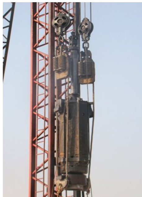
100% indigenous Pneumatic Hammer (5.4MT weight)

There was time when Driven Cast-In-Situ (DCIS) piles of 330mm to 450mm diameter were the very first choice of foundation wherever a good bearing stratum is available within 15.0m to 20.0m depth. DCIS piles have closed bottom seamless MS tube driven into the soil to a desired length and thereafter the reinforcement cage is lowered and concreting is done. After complete concreting, the casing is extracted. This pile offers advantages of speed, economy and quality. The reach of good bearing stratum kept increasing as the constructions moved to unfavorable geotechnical environment and for larger capacities, bored cast-in-situ piles were depended upon. The segmental precast driven piles did not become popular.