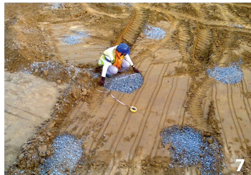
Step 7: Installed stone columns