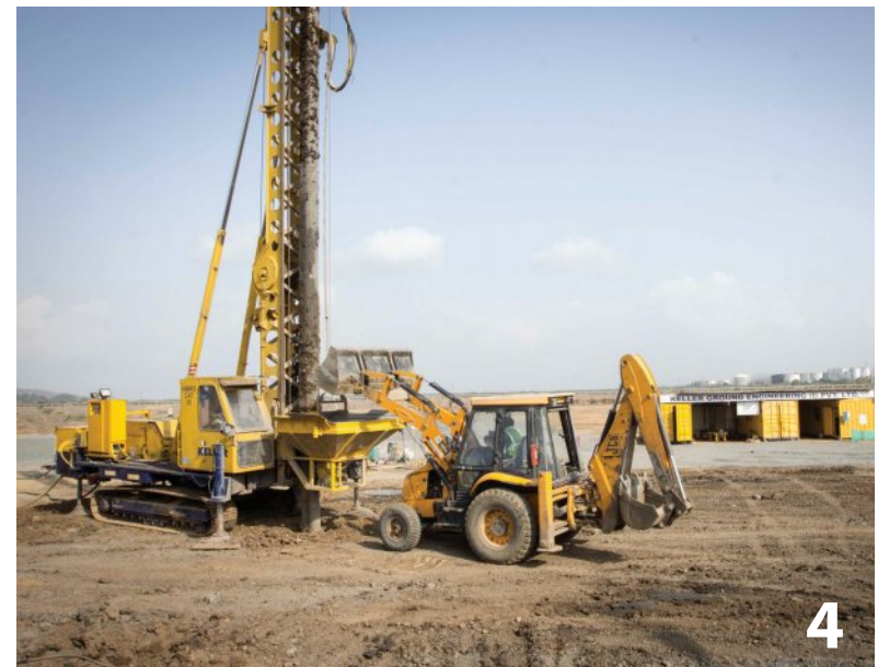
Step 4: Stone feeding through the skip (parallel operation while penetration of vibrator)