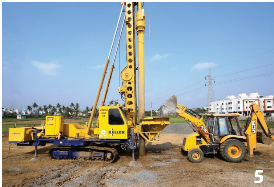
Step 5: Building of stone column from bottom to top