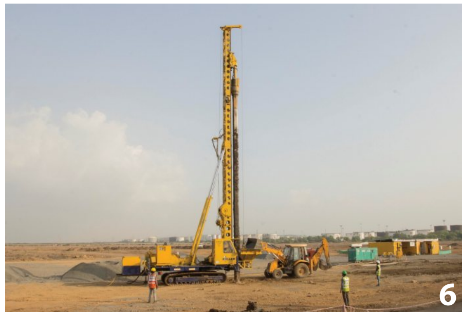
Step 6: Fag end of building of stone column (vibrator reached at surface)