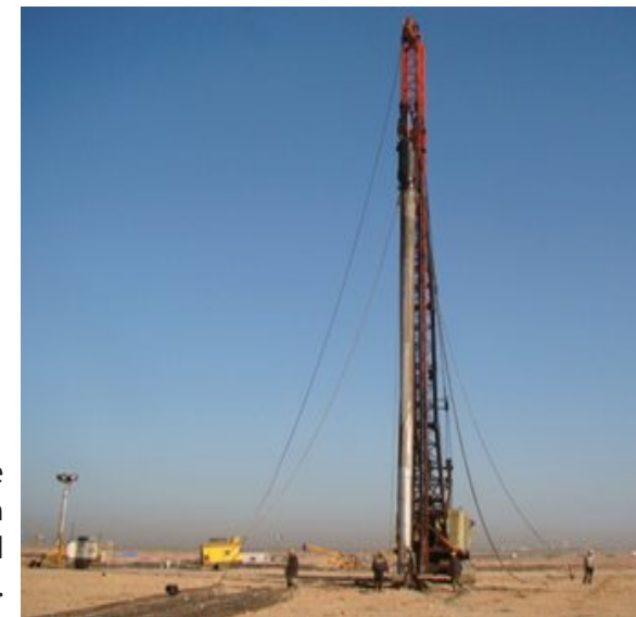
DCIS Piling Rig

Since all methods of driving improve most subsoils, driven systems produce a rough concrete surface area, they are able to develop higher shaft friction than any other type. Flat bottom steel shoe are used which are stronger, and are rarely damaged even under hard driving conditions and are known to keep the pile tube dry even under high water table.