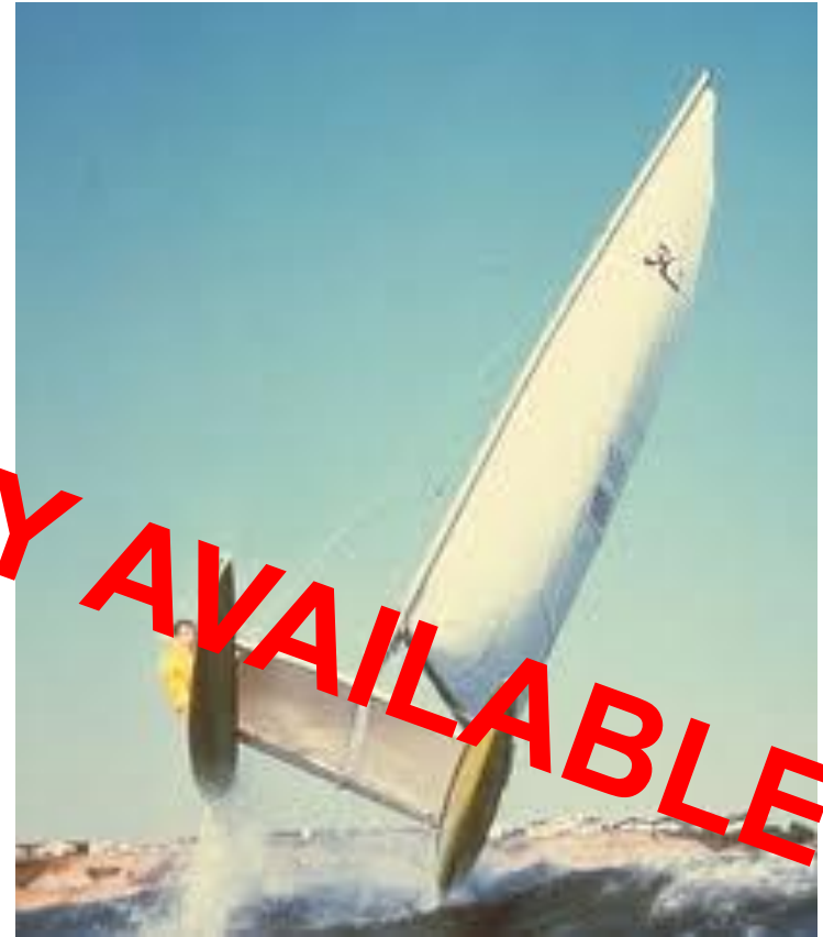
Sample Boat Image

Please contact NCS at 508-228-6600 if you would like in more information on purchasing this boat. Please reference Boat #10. All boats sold in as is condition.