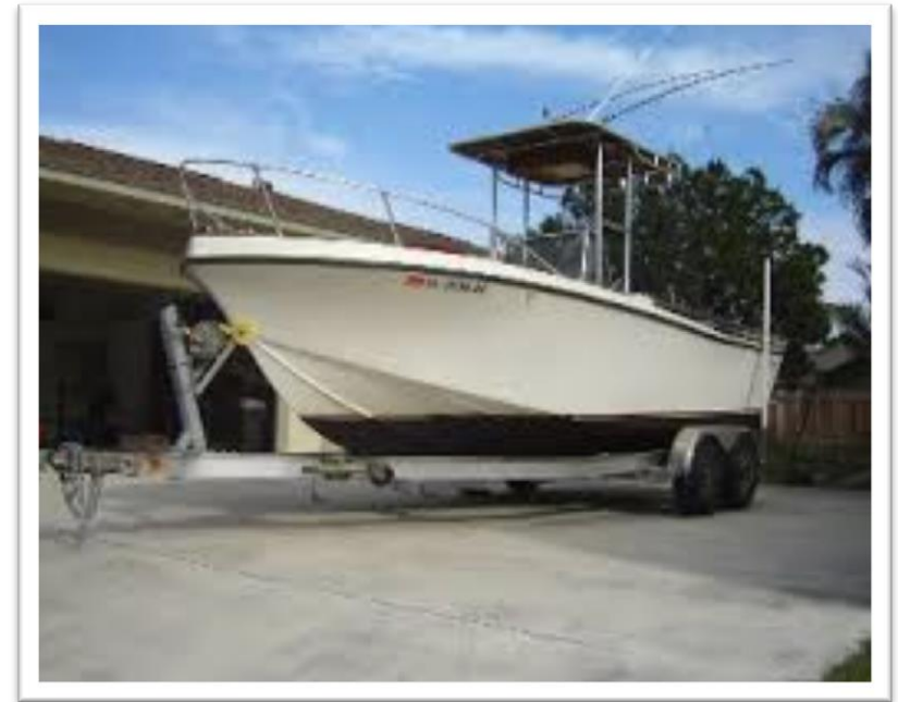
Actual Boat Image