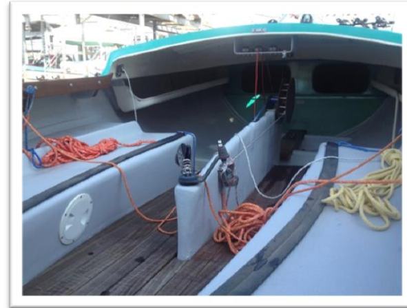
Actual Boat Images