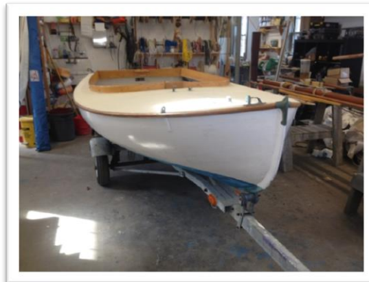
Actual Boat Images