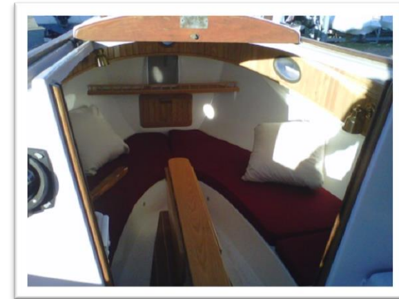
Actual Boat Images

▶ Please contact NCS at 508-228-6600 if you would like in more information on purchasing this boat. Please reference Boat #1. All boats sold in as is condition.