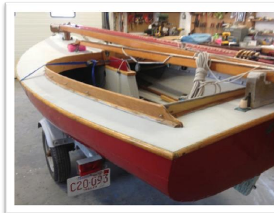
Actual Boat Images

Please contact NCS at 508-228-6600 if you would like in more information on purchasing this boat. Please reference Boat #7. All boats sold in as is condition.