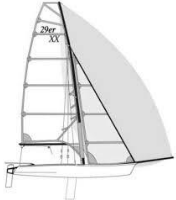
Sample Boat Image

Please contact NCS at 508-228-6600 if you would like in more information on purchasing this boat. Please reference Boat #9. All boats sold in as is condition.