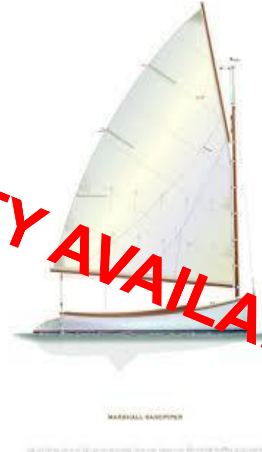
Sample Boat Image

Please contact NCS at 508-228-6600 if you would like in more information on purchasing this boat. Please reference Boat #4. All boats sold in as is condition.