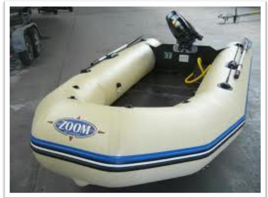
Actual Boat Image

Please contact NCS at 508-228-6600 if you would like in more information on purchasing this boat. Please reference Boat #11. All boats sold in as is condition.