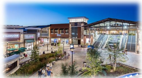
Clarksburg premium outlets