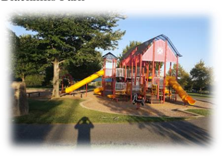
Ovid Hazen Wells Recreational Park