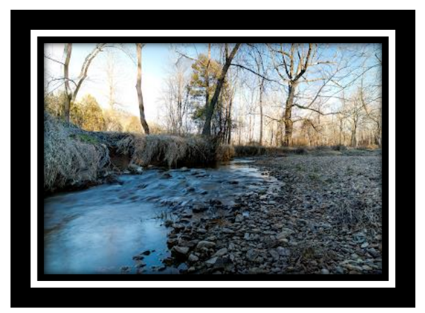
Little Bennett Regional Park

a brick front with a large two car driveway and a large 2 car garage. Enjoy breakfast on your deck (great for entertaining) which overlooks the woods. The finished basement has a rec room great for children to play in or have them enjoy the sun filled 4th floor loft which can also be used as an extra bedroom or an office. Hardwood floors on main floor with carpet upstairs and in the basement. This dream home can be yours at a steal of a price!