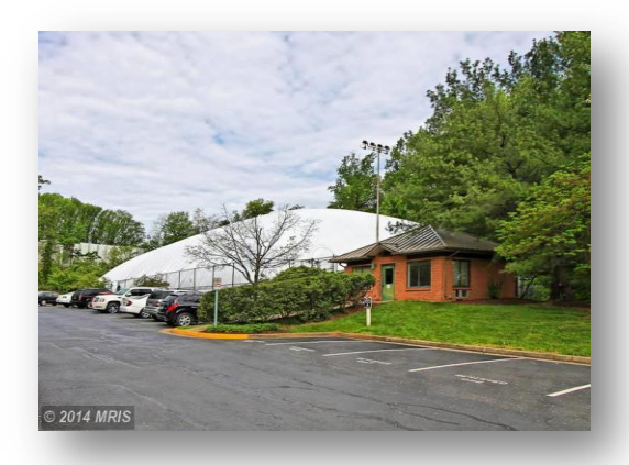
Year round tennis courts and fitness center