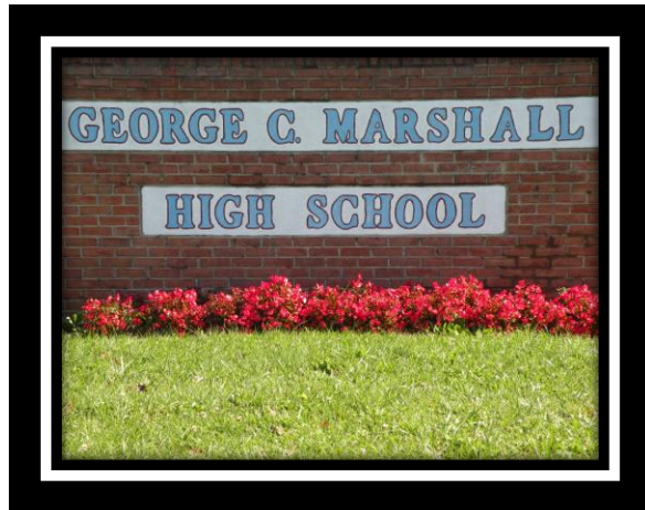
Marshall High School

Beautiful and spacious Van Metre home in the heart of Tysons Corner. Brick front, oak & hardwood on main floor with 2-story foyer. The family room is off the gourmet kitchen, elegant living and dining room with crown molding throughout. Upstairs features a huge master bedroom with a awesome luxury bathroom. All the other bedrooms are spaciously large. Lower level basement come with a large rec room and a full bath. Great commuter location, walk to shopping and restaurants.