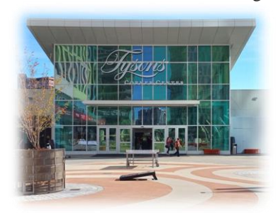
Tysons Corner Mall