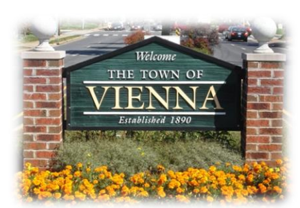
Tons of shopping and restaurants