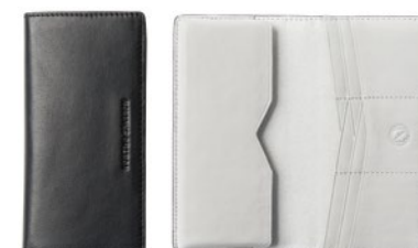
Black & Dove Grey Nappa