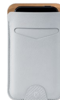
Dove Grey Nappa