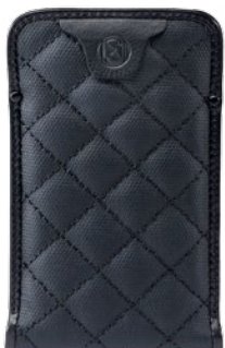
Black Nappa with Black Canvas

Composition: Nappa leather, Nubuck leather and Coated Canvas