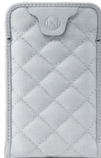
Dove Grey Nappa with Grey Canvas