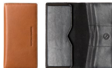
Tan & Black Nappa

Composition: Nappa leather and Suedette lining