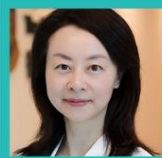
Nancy Kwan Man Hong Kong