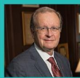
Goran Klintmalm USA