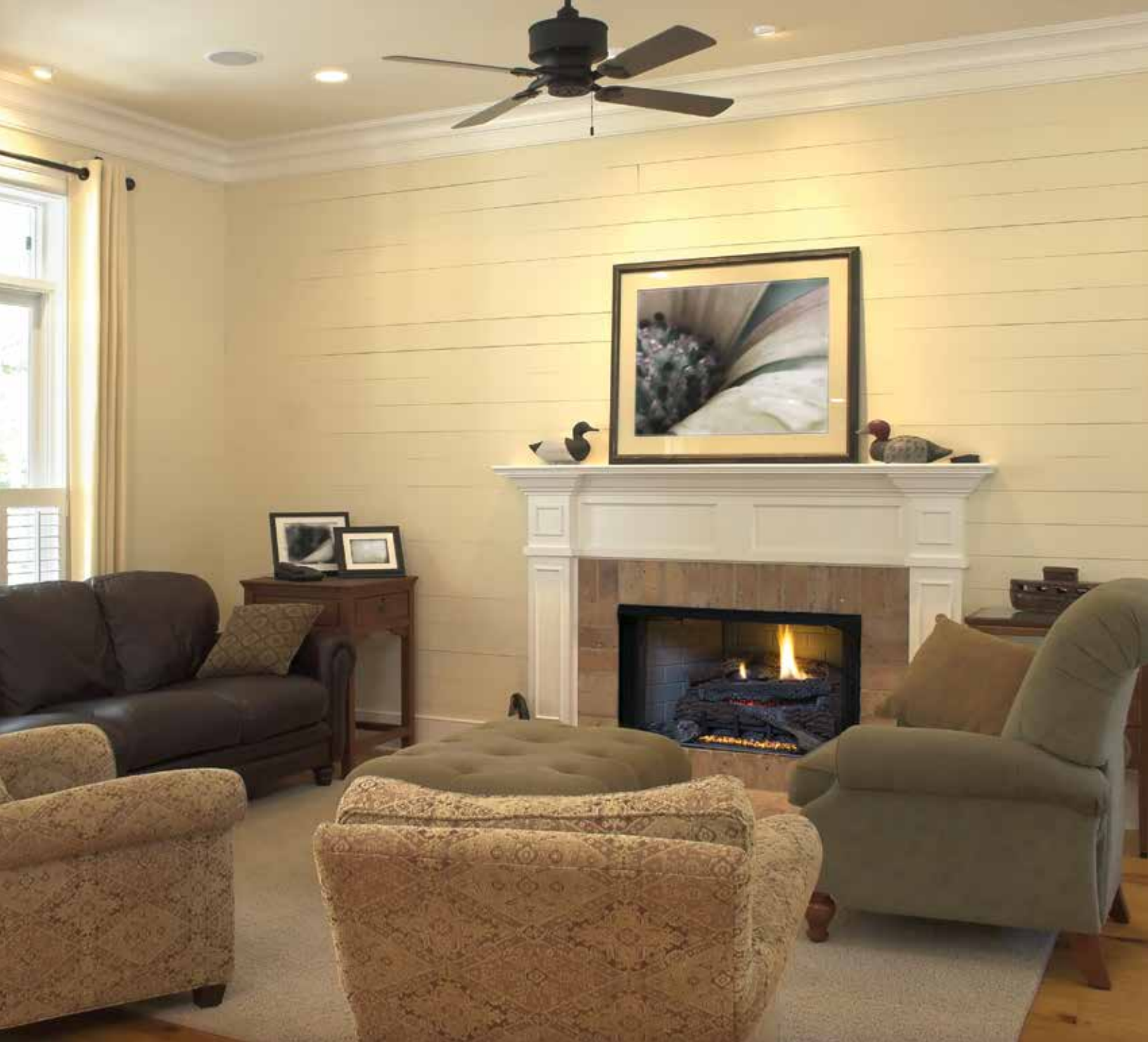
FEATURED Vega with White Stacked Refractory Panels and Boulder Mountain Vent-Free Gas Log Set