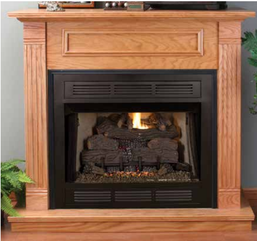
Vega with optional Timber Oak Vent-Free Gas Log Set

Choose from a variety of refractory panels or porcelain liners.