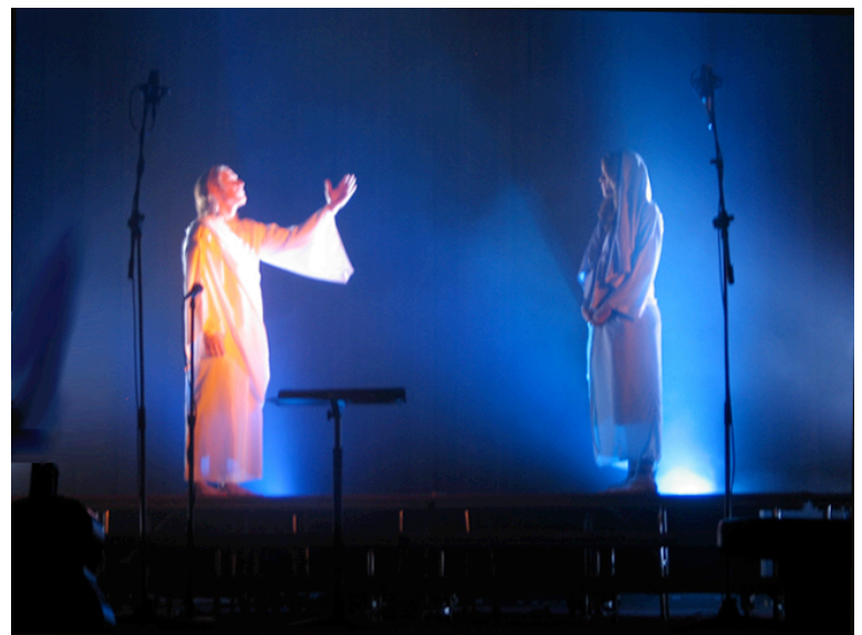
Gabriel (and Mary)