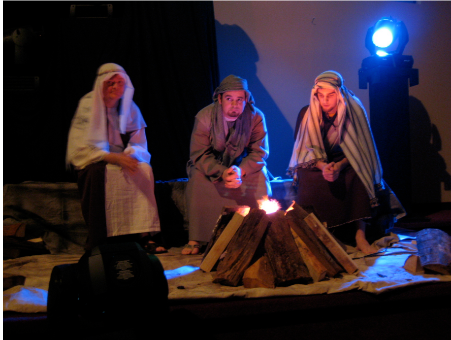
Shepherd Scene (stage left)