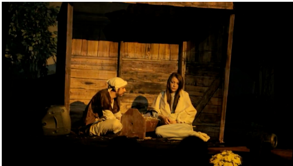
Stable Scene–Stage Right