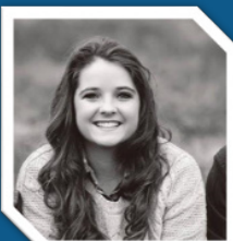
Taylor Mills Worship