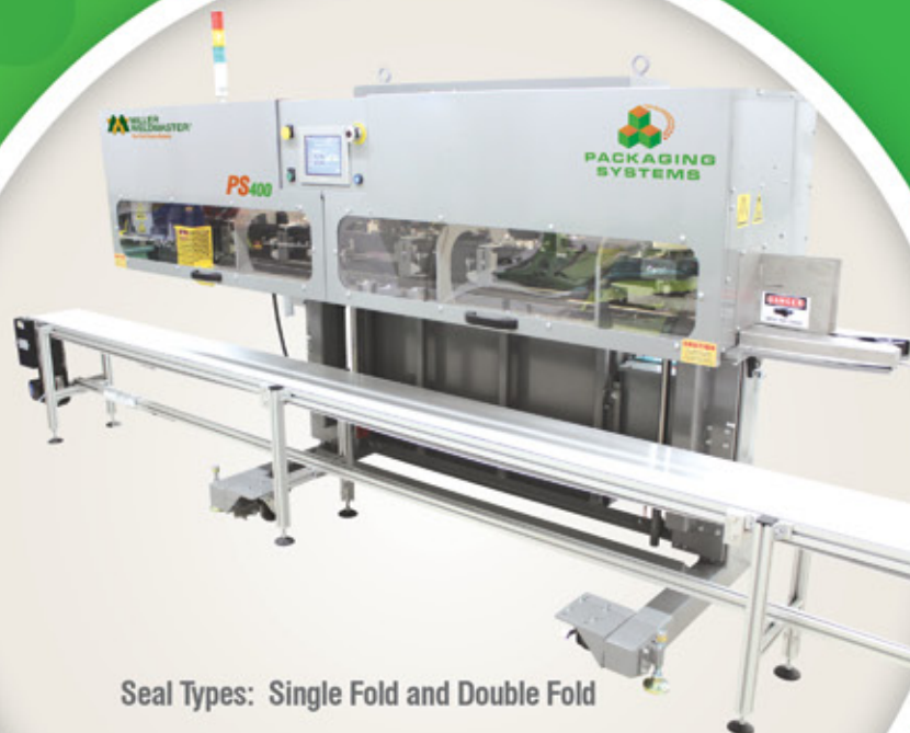
Seal Types: Single Fold and Double Fold