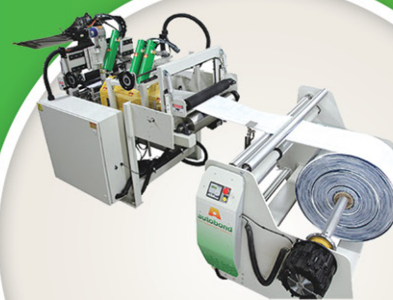
Seal Type: Back Seam