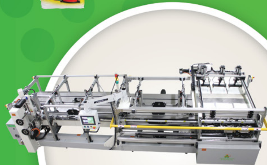
Seal Type: Folded Closure