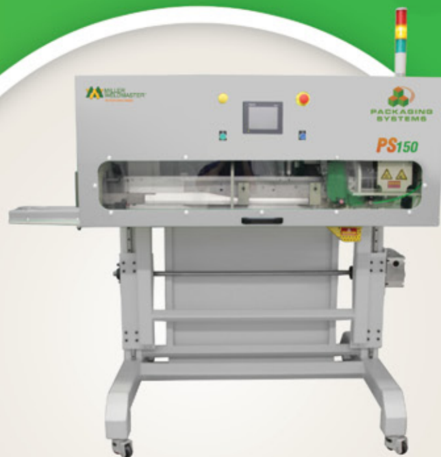
Seal Type: Single Fold