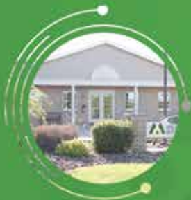
Miller Weldmaster Corporate Headquarters Navarre, Ohio