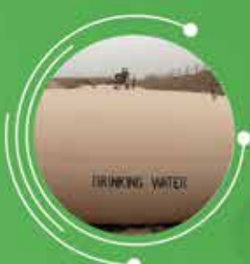
TANKS & BLADDERS