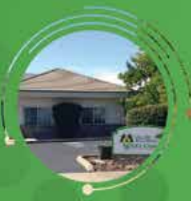
Miller Weldmaster West Coast Diamond Springs, California